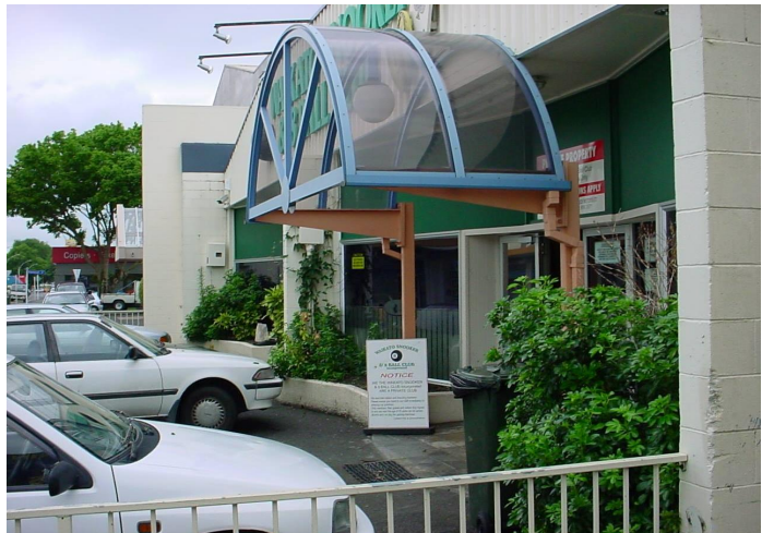
Hamilton Clubrooms (2002)

With the Club's expansion beyond the Waikato region it made sense to change the Club's name to one that focused more on what we're about, hence the name Massé. Massé is a name for a cue stroke that we ironically don't allow to be played on our tables due to the potential damage to the cloth being caused by those who do not know how to play the shot properly! Massé is derived from the French word masser which means to strike from above with a hammer .