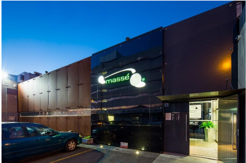
Massé Hamilton Clubrooms

Through your membership of Massé you are able to enjoy the facilities that our Club has built up over the years. For those who are Financial Members you can participate in the many tournaments that the Club organises. These range from our in-house tournaments and leagues such as the VNEA Senior and Junior 8 Ball Leagues to the Predator 9 Ball League, the Poison 10 Ball League, and the McDermott 8 Ball League.