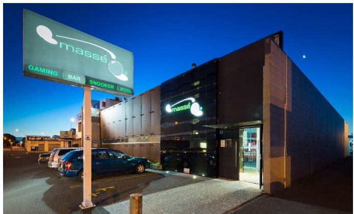
Hamilton Clubrooms (2016)

Massé is also the New Zealand Charter Holder for VNEA Pool Leagues meaning the Club not only organizes and runs VNEA 8 Ball Leagues within New Zealand, but that it is also responsible for the selection of the New Zealand senior and junior teams that travel to the United States each year to compete in the VNEA World Pool Championships. In 2016 New Zealand will be represented by 24 players at the World Champs!